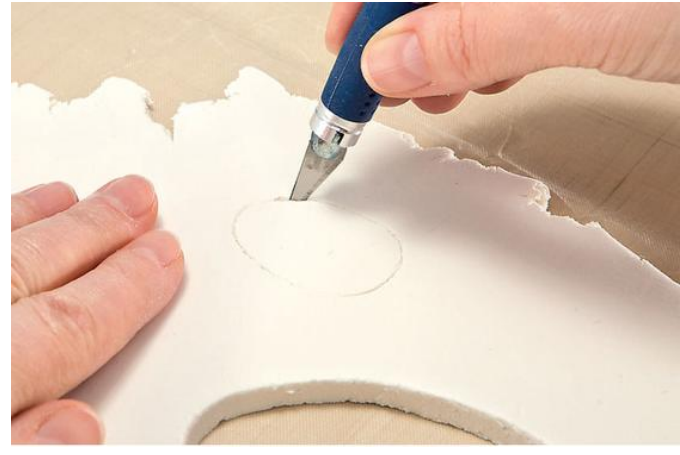
Modelling motif shapes First transfer the templates to cardboard and cut them out. The Modelling clay is rolled out between

Our handicraft instructions can tell you exactly how to create the decoration idea here in the download.