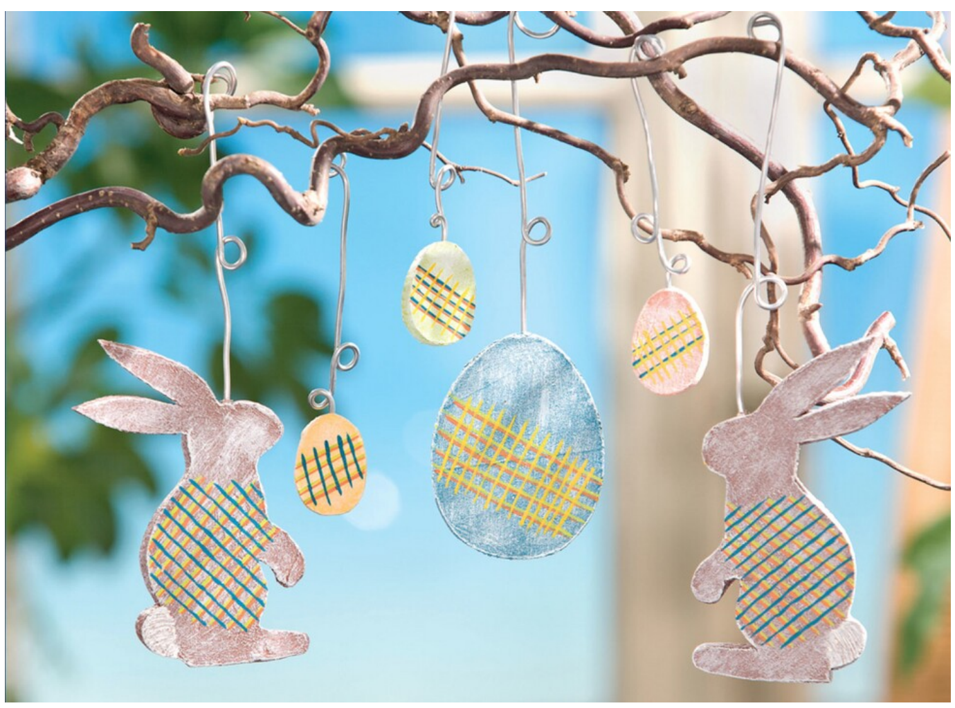
A quick handicraft idea with guaranteed success, which is also great as a souvenir. The Modelling clay "Ultra-Light", VBS Hobby Color paint and some aluminium wire - that's almost everything you need for these pretty pendants.

Our handicraft instructions can tell you exactly how to create the decoration idea here in the download.