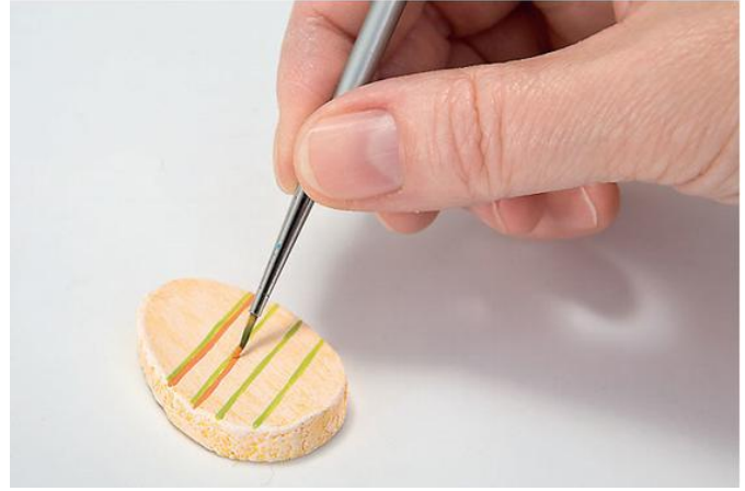
Painting shapes & hanging wire The rabbits are presented in a colour mixture of Brown and Orange, the eggs are primed with colours