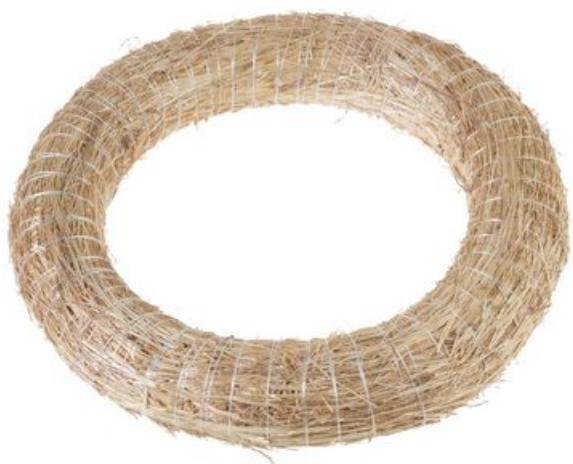
Straw wreath Ø 30 cm