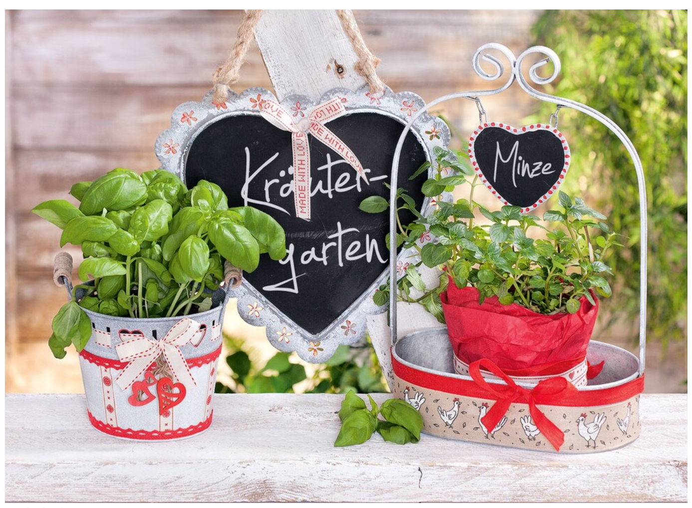
And it's that easy:

The country house style for spring or summer always promises a wonderful decoration for inside and outside. In this guide we show you ideas how to make a great individual design out of zinc bowls and decorative panels with a little paint and different ribbons.