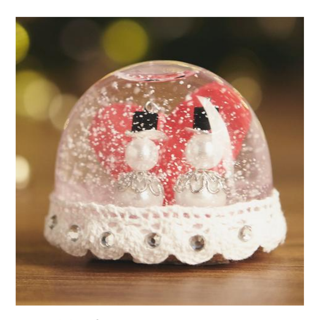
Snow globes for many occasions

Dreamballs do not fascinate only in wintertime. They are also ideal as a lucky charm for wedding couples, for small messages and more.