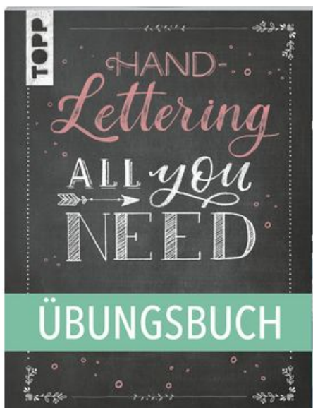
Book "Handlettering All you need. Das Übungsbuch"