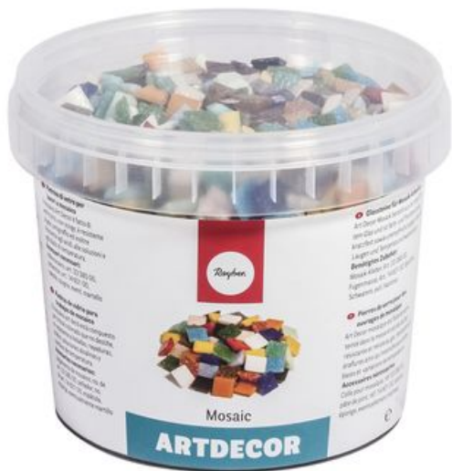
Artdeco glass stone mosaic mix, Colourful-Mix