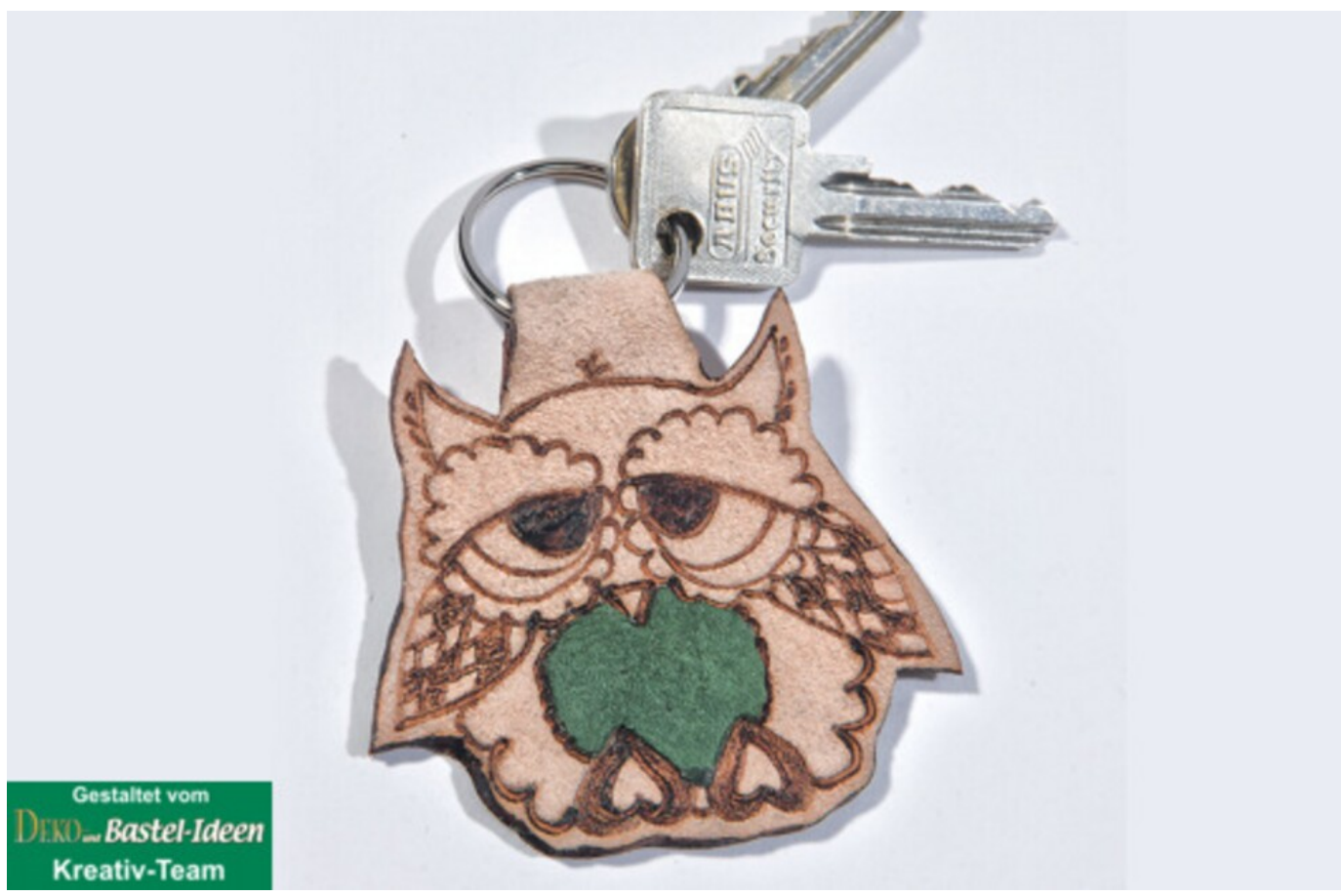
It Wooden burning was originally used quite practically for marking private property. But it can do much more!

With a little practice and fingertips feeling, filigree patterns and lettering are created, which turn a simple blank into a fallen unique specimen.