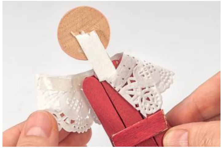
Very decorative as collar: lace paper.