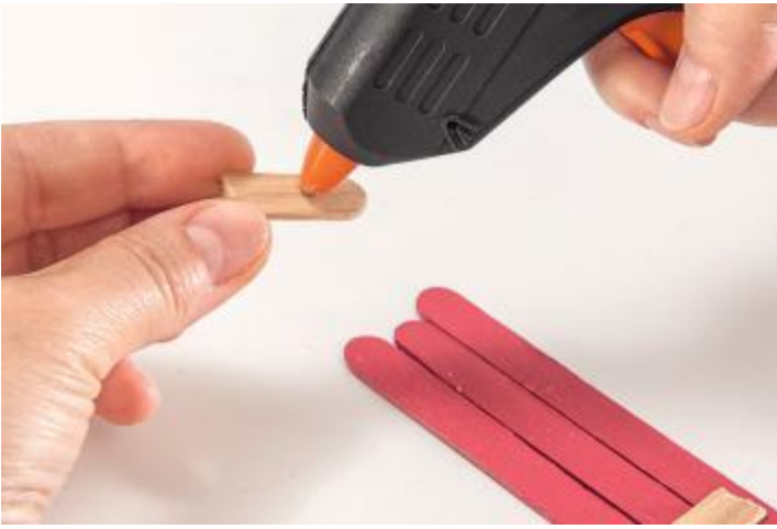
Carefully glue the Wooden sticks with the hot glue gun.