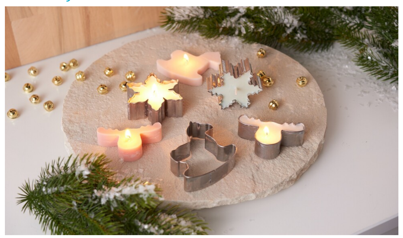
First melt organic wax in the melting pot. Dyeing granules can be added as desired.

Create Christmas candles in the shape of snowflakes, moose heads and rocking horses. With common cookie cutters you can punch out any shape and use it as a candle. A great idea also as a small Christmas gift.