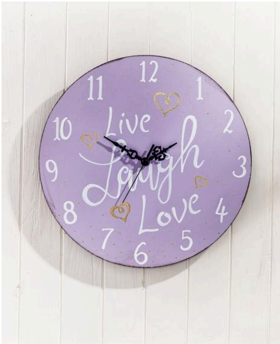
On small furniture