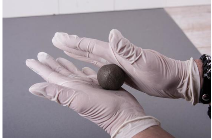
<u>Kneadable concrete</u> is a fine, very smooth and airdrying Modelling clay. material. It is supplied in powder form and is first mixed according to instructions. Afterwards it can be easily processed and is suitable for interior and exterior decoration.

To make the little bunnies, first form small balls and stretch them slightly. Then simply make a small cut in the tip of the modelled oval shape with an old knife. From this the rabbit ears are formed.