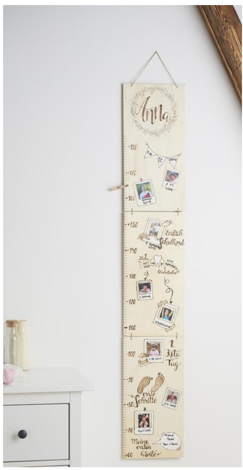
Ready designed it is an eye-catcher: