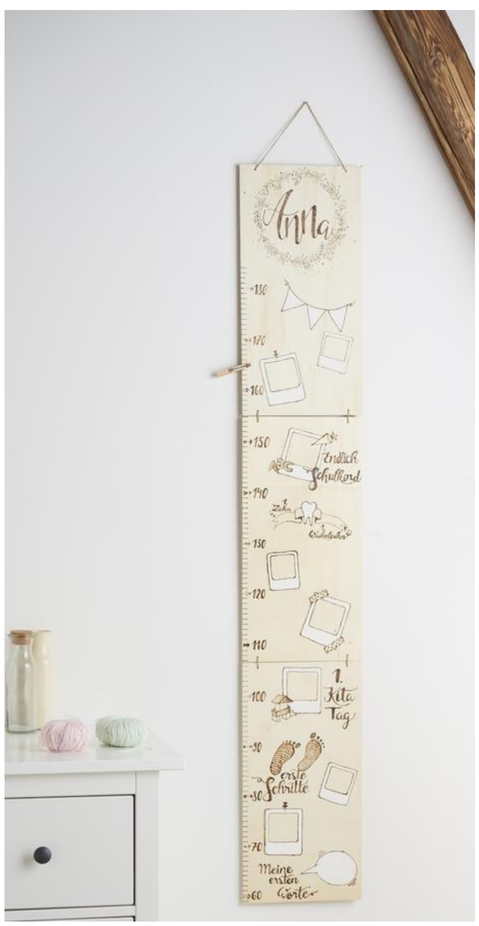
The yardstick in the raw version: