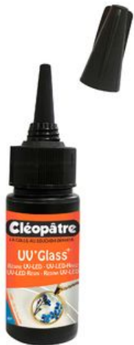
UV Casting resin "Cléopâtre Resin UV'Glass", 25 g