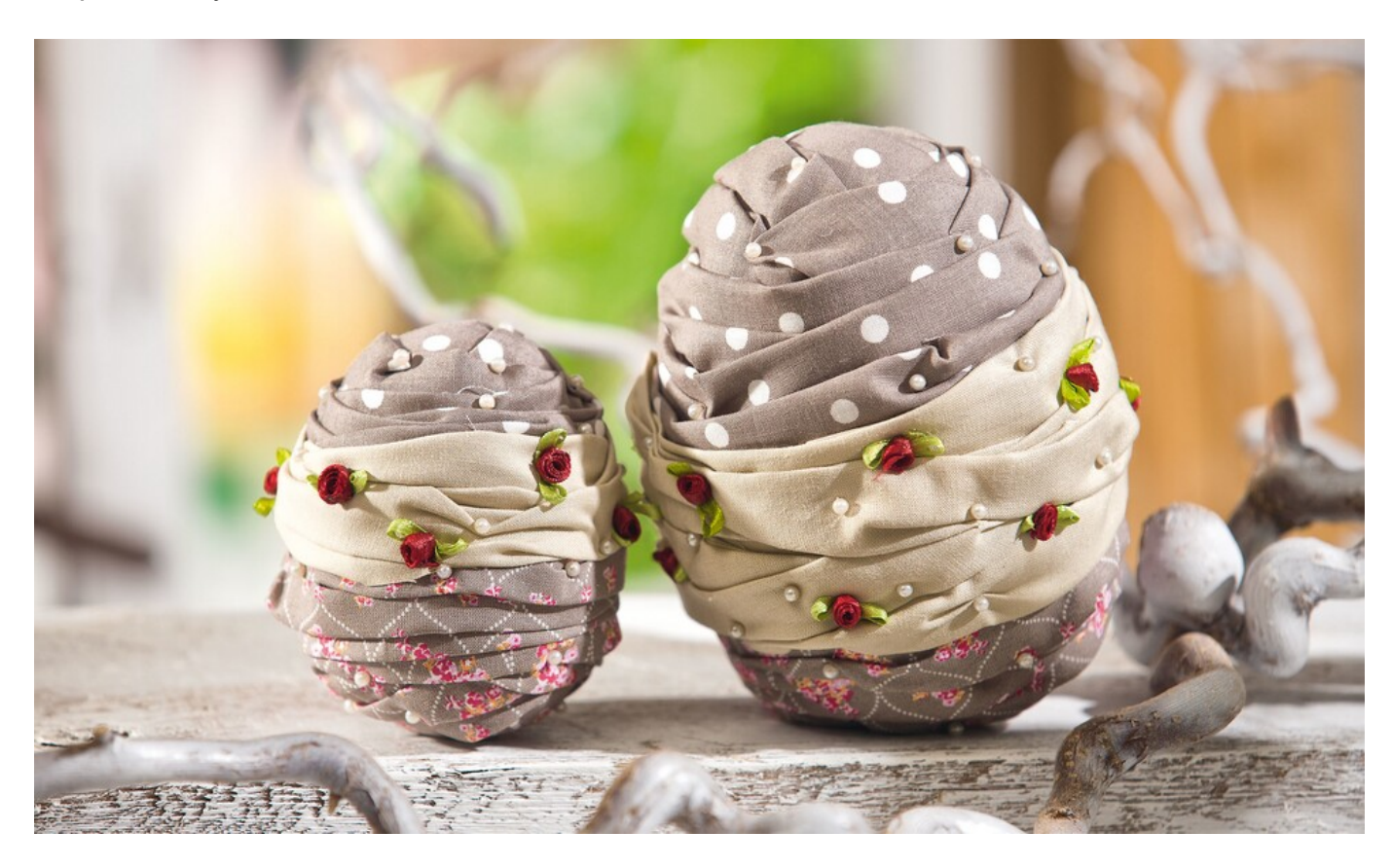
Here's how it works

With a few simple steps you can transform white Polystyrene-eggs into exclusive Easter decorations in country house style . The fabric strips are wrapped around the shapes at only and fixed with Pins - very simple and very effective.