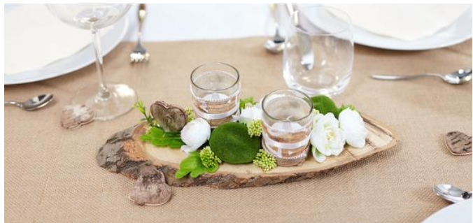
Table arrangement on tree disc

Cover the tealights with double-sided Adhesive tape with a decorative ribbon : a festive ribbon and classic white Satin ribbon. Natural-coloured Yarn harmonise perfectly with it. Wrap the lower part with string, Adhesive tape also helps to fix it in place