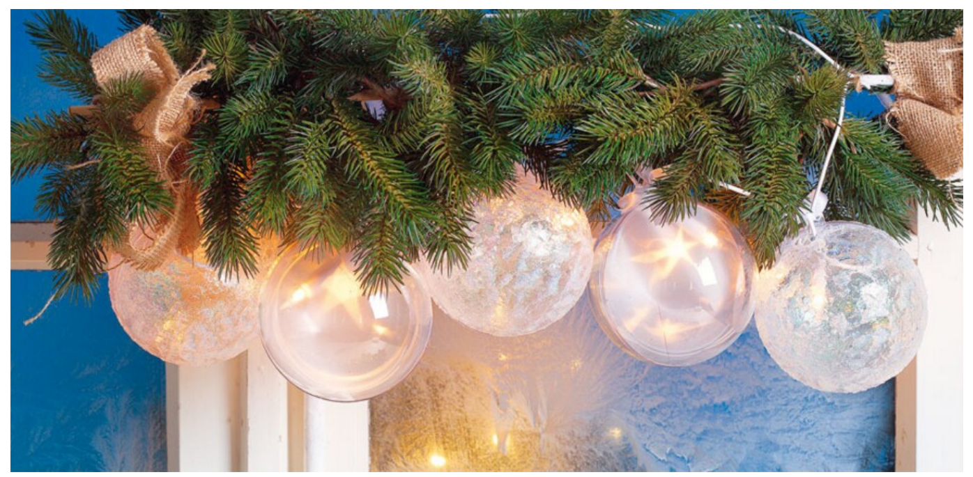
And it's that easy

The glitter paste reflects the light to the mysterious nature of the snow and the foil captures the glow of the stars. Hang this pine garland in your window, decorate your staircase or simply any place in your house by perfectly showing off this sparkling winter decoration.