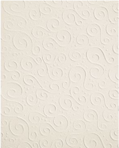
Embossed cardboard Milan, approx. 50 x 70 cm, 220 g/sqm, Champagne