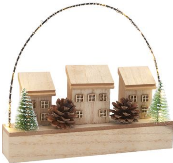
VBS Complete set "Winter village with light arch"