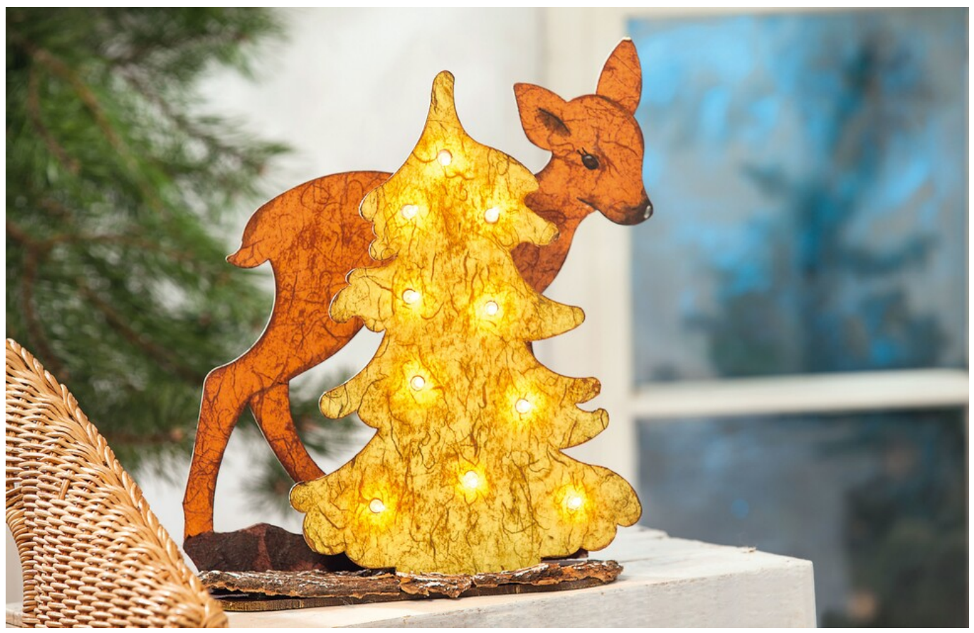
Here's how it works

This little deer is deliberately simple in design. The wooden elements are Straw silk paper glued on, the face is designed with few contours. Quite simple - quite timeless.