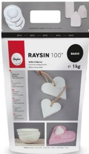
Casting powder "Raysin 100", white, 1 kg