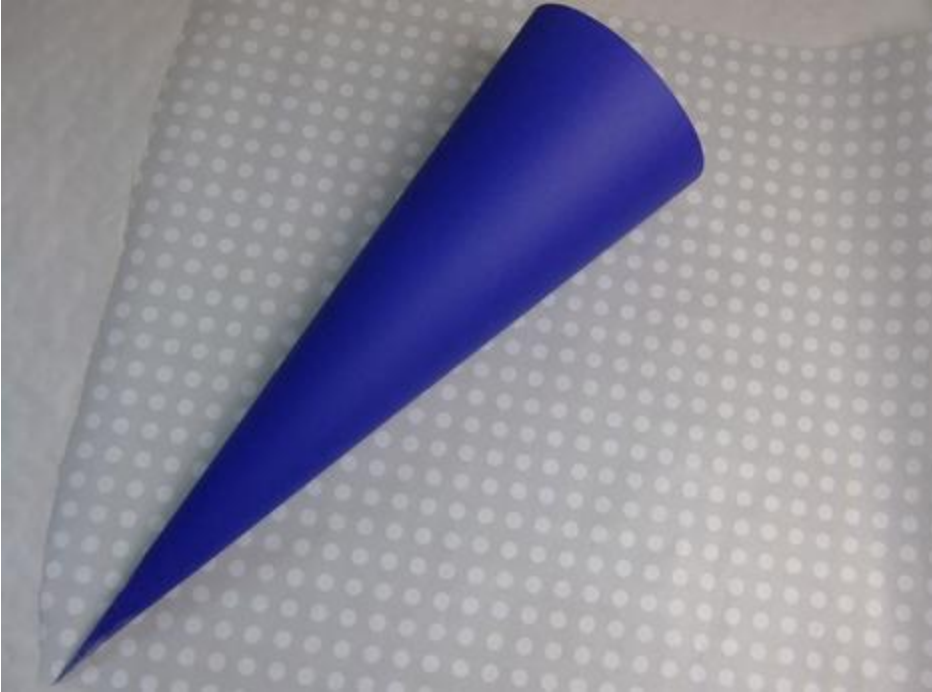
School gift bags-Use blank as Pattern-template

which can be used to close the filled bag on the day of school.