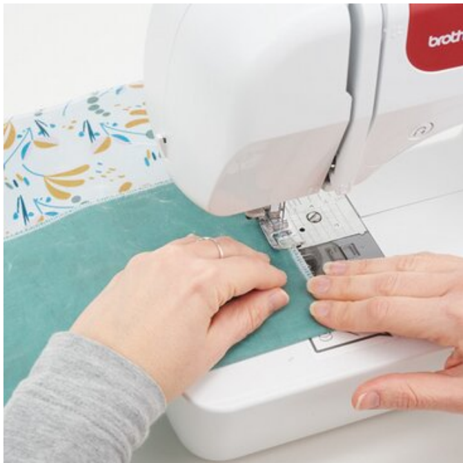
9. sew pocket sides