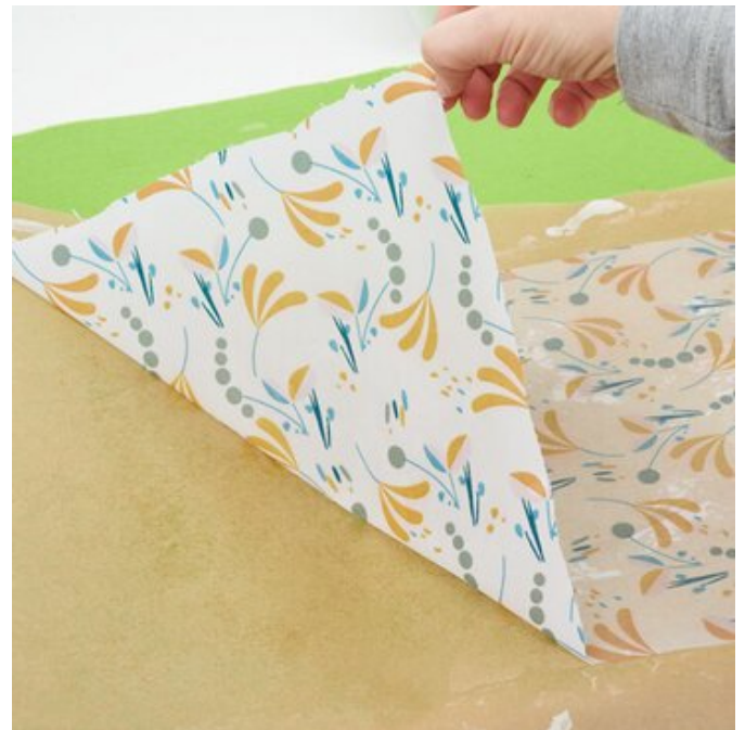
4. pull off fabric blank