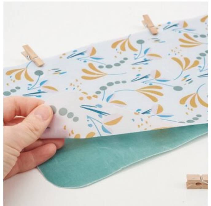
6. stitching together