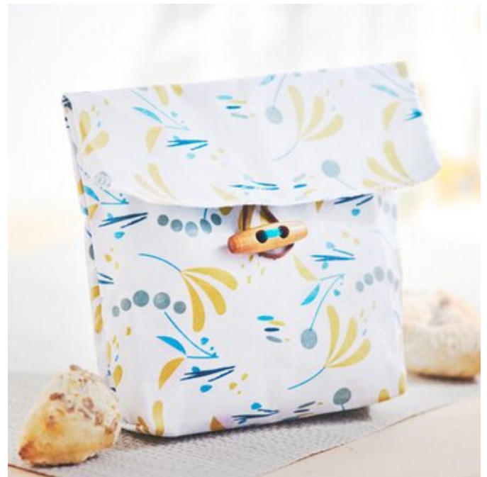
12. sew on button