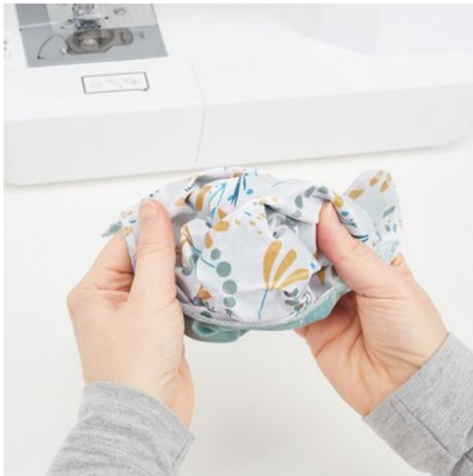
11. turn the pocket