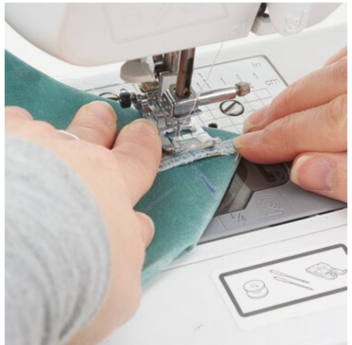
10. sew off pocket corners