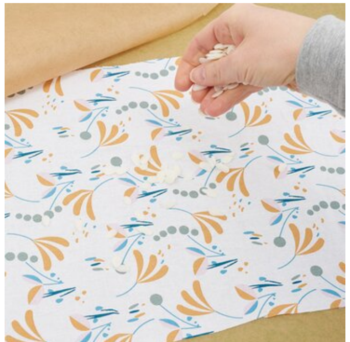
2. sprinkle with beeswax