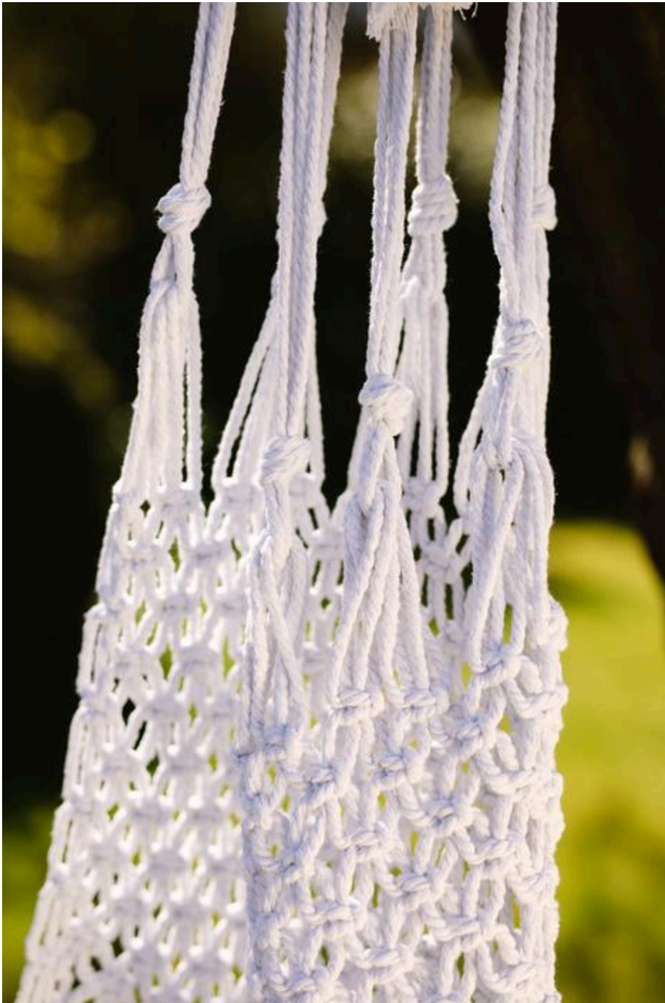
Knot suspension cords on macramé piece