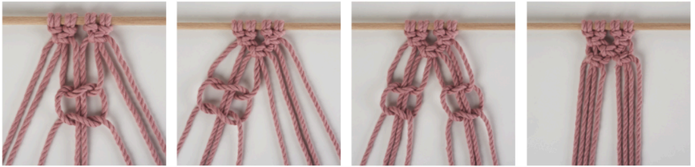
Row 7 - 8 = Horizontal rib knots