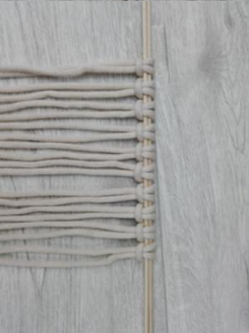
Step 1: The "basic knot"