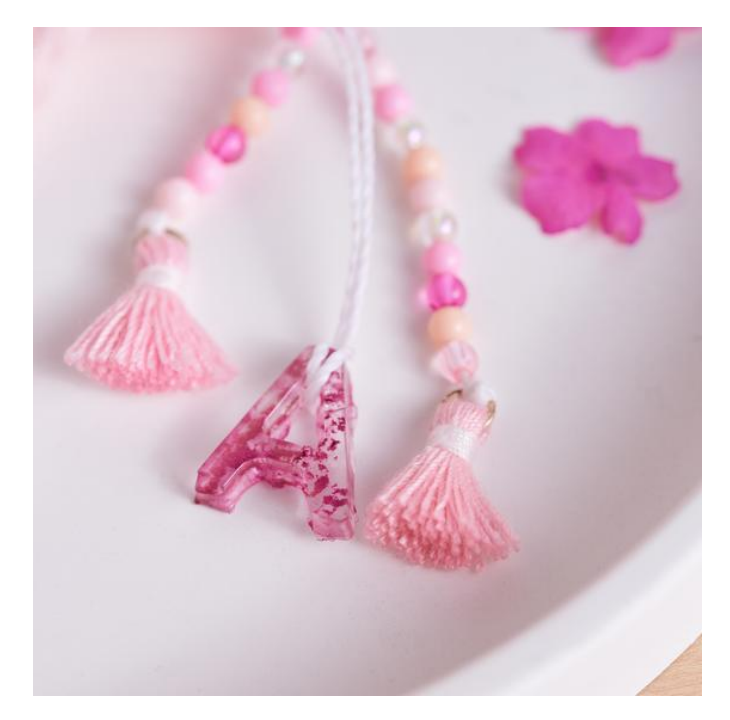
Step 3: Remove the creation from the mould

After hardening, carefully remove your creation from the mould. If the resin still feels a little sticky, simply give it a few more minutes under the UV lamp. Make sure to take a short break between each curing process to avoid overheating the materials, which could lead to an unsightly surface.