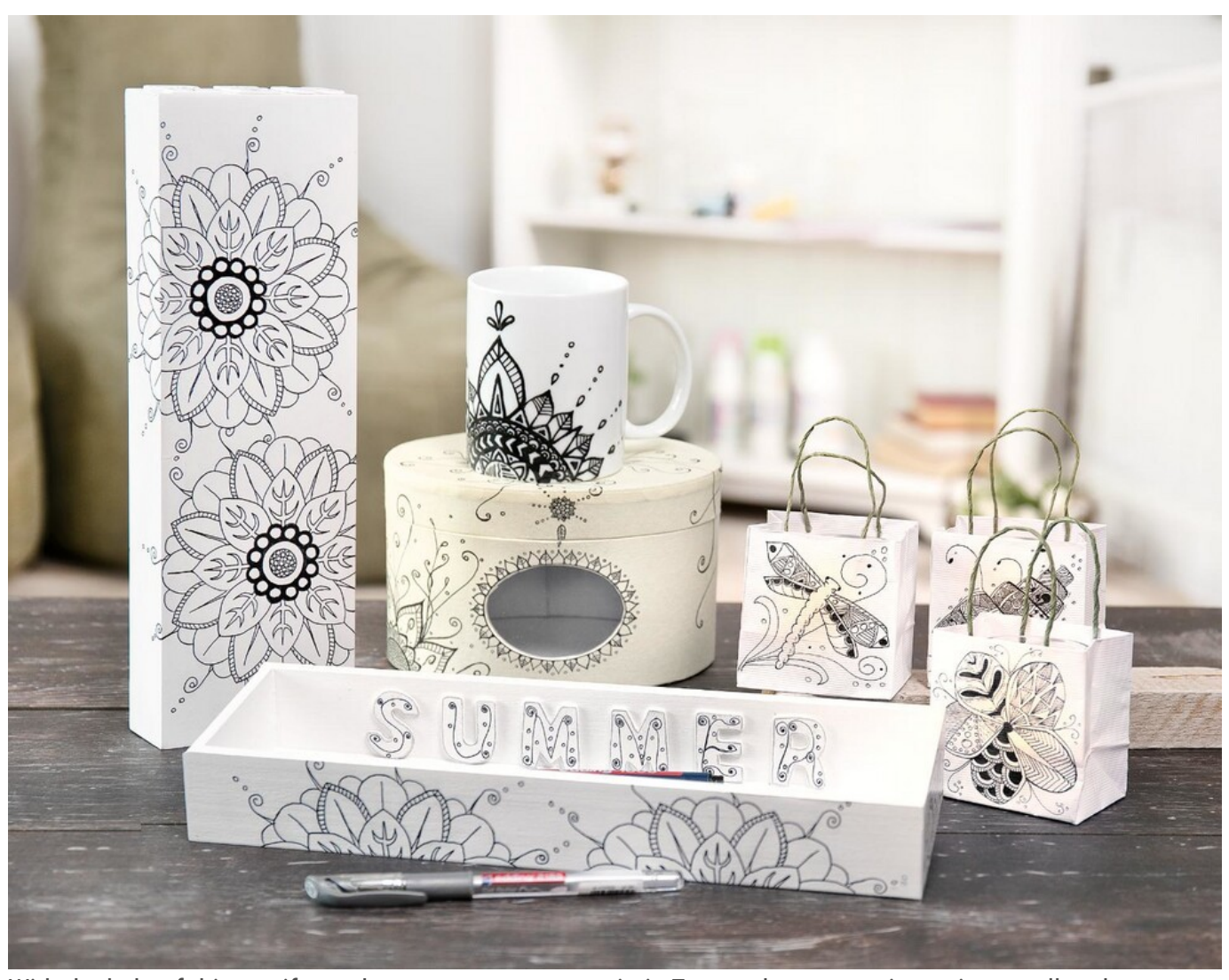
With the help of this motif template, you can create artistic Zentangle patterns in no time at all and ensure creativity and relaxation

The creative pattern is a real eye-catcher for decorative objects, t-shirts, Gift wrappings and much more Transfer the patterns for example with the transfer paper or use the pattern template as creative inspiration for new Zentangle designs