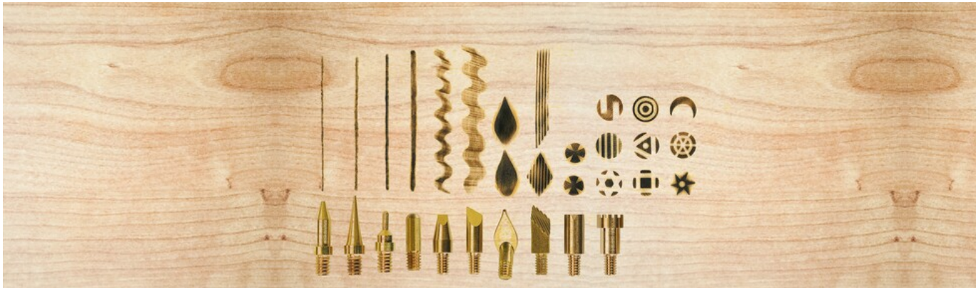
All products for handicraft technology Wooden burning at a glance