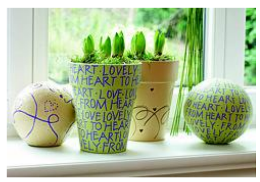
Here's how it works

First, the plant pots and decorative balls are sprayed with the edding spray in the cloister at a distance of 15-25 cm. Then paint on the decorative patterns and lettering with our copy template