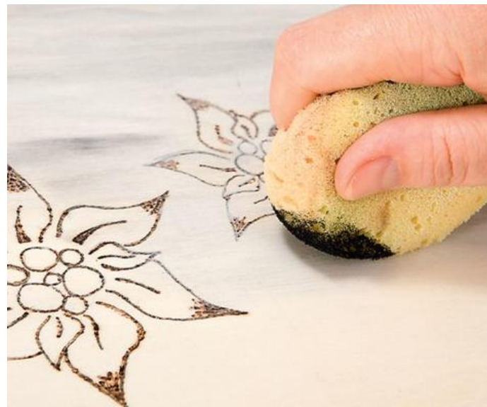
Step 1) Trace contours with the fine tip of the firing station. This idea is timelessly beautiful!