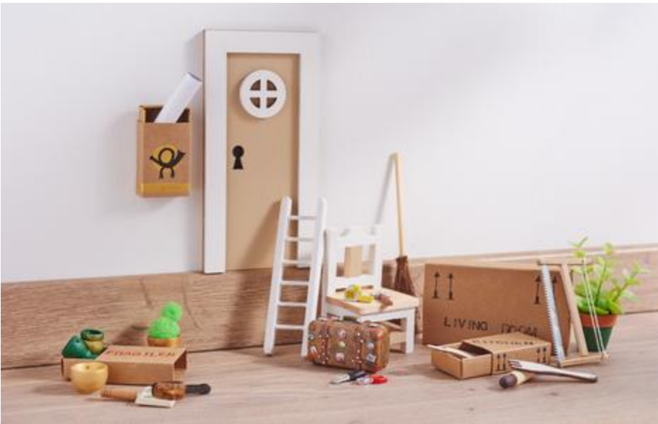
Tomte moves in