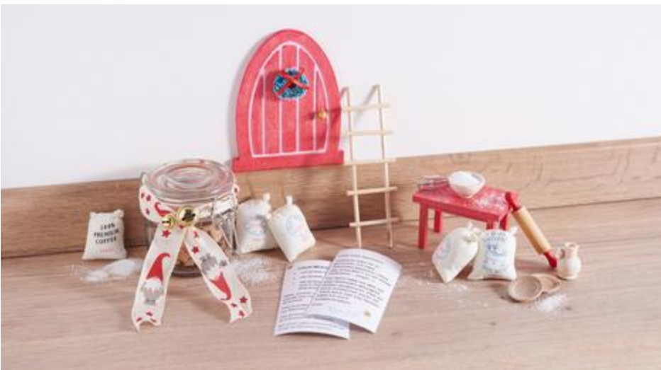
Tomte bakes biscuits