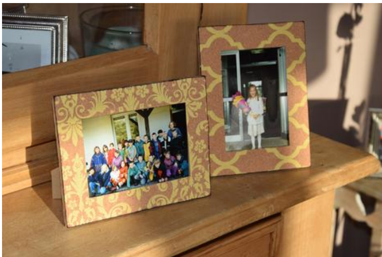
Discover another cork idea: Cork picture frames