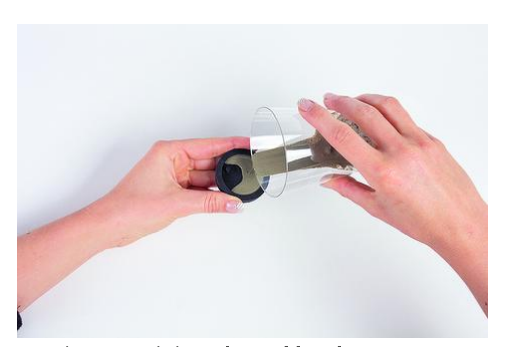
....just pour it into the mold and...