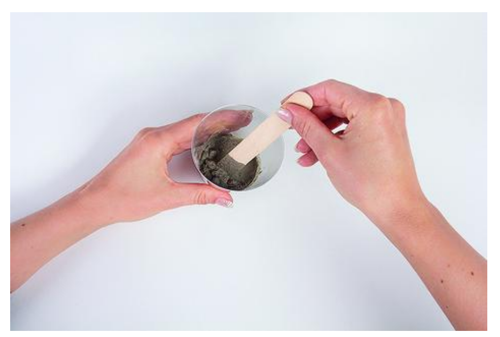
Casting compound touch,..