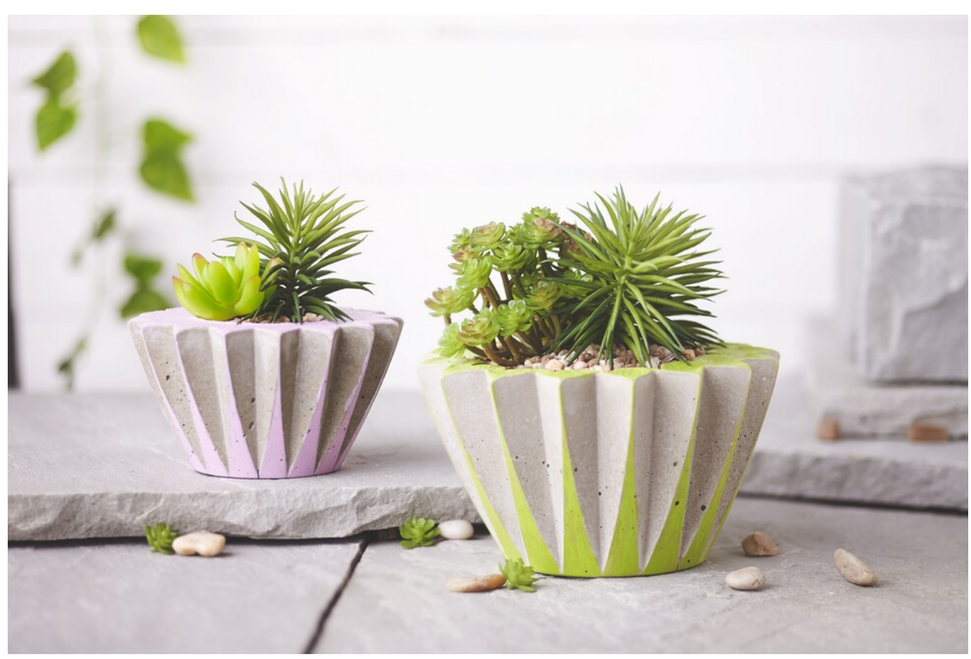
Here's how it's done

Concrete is an incredibly versatile material that can do far more than just fulfil the basics of construction. With a little creativity and craftsmanship, you can create decorative containers for your green plants in no time at all. These homemade concrete planters not only give your home a modern, industrial look, but also offer a durable and unique way to express your love of plants.