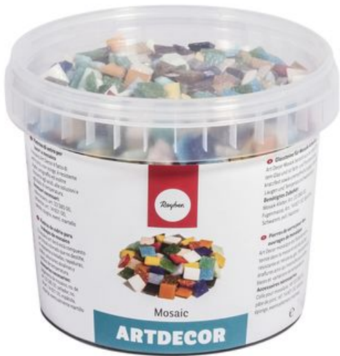
Artdeco glass stone mosaic mix, Colourful-Mix