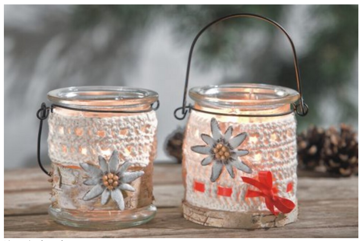
It's as simple as that

Cast 45 air stitches and close them with a warp stitch to form a ring. Then crochet in rounds to the desired height. You can use the instructions for the lampshade as a guide