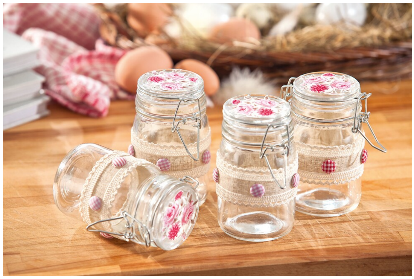
Here's how it works

These storage jars can be quickly and easily decorated to your personal taste. With a little Lace ribbon wrapping and small accessories such as buttons or Motif straw silk the simple glasses get their special charm.