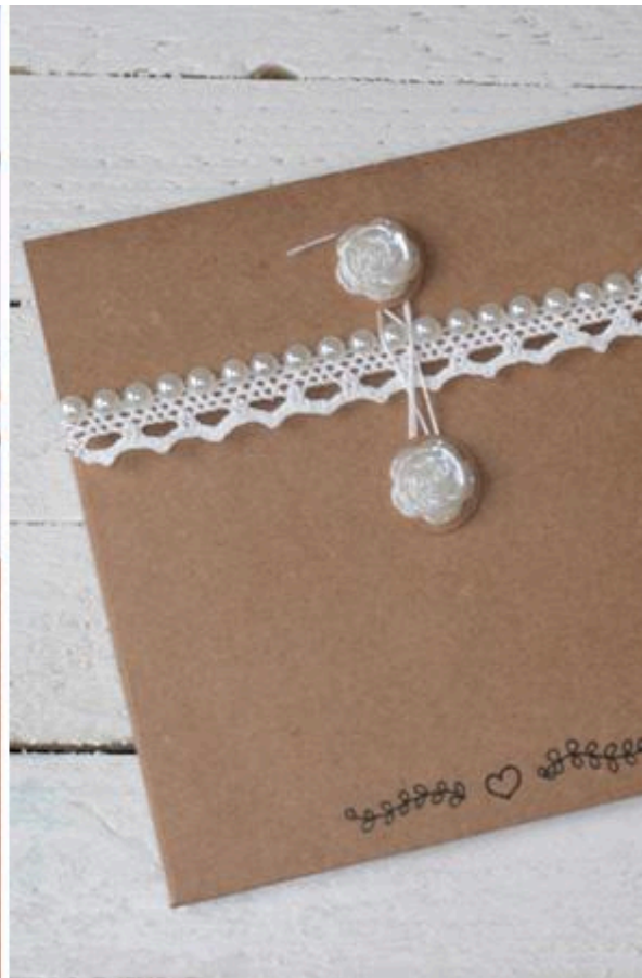
Step 3: Tissue Pockets "For Tears of Joy"