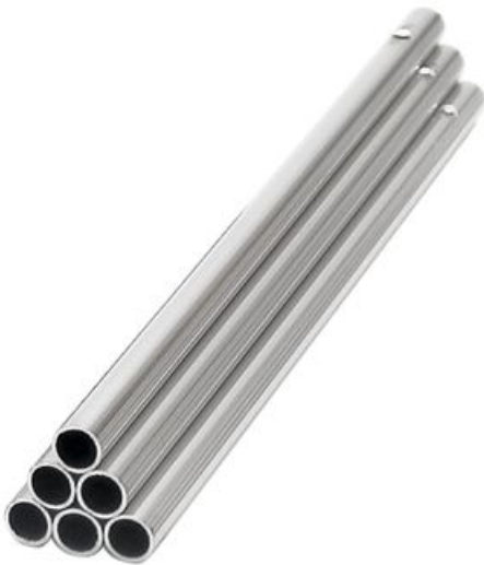
Sound bars "Hollow", 6 pieces, Silver color